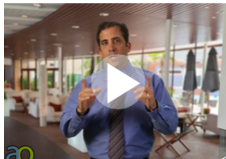
The Power of Perception